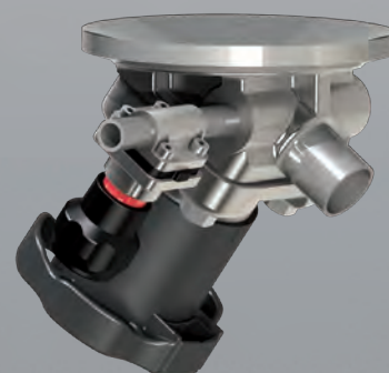
Welded sampling unit on request